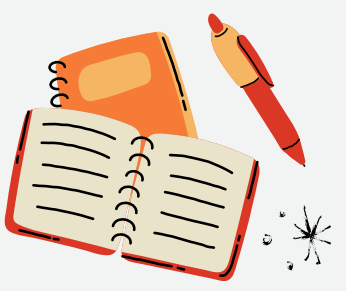
Follows a fixed schedule with set lesson plans and weekly assignments.

Opportunities for interaction with instructors and peers through class discussions, group projects and